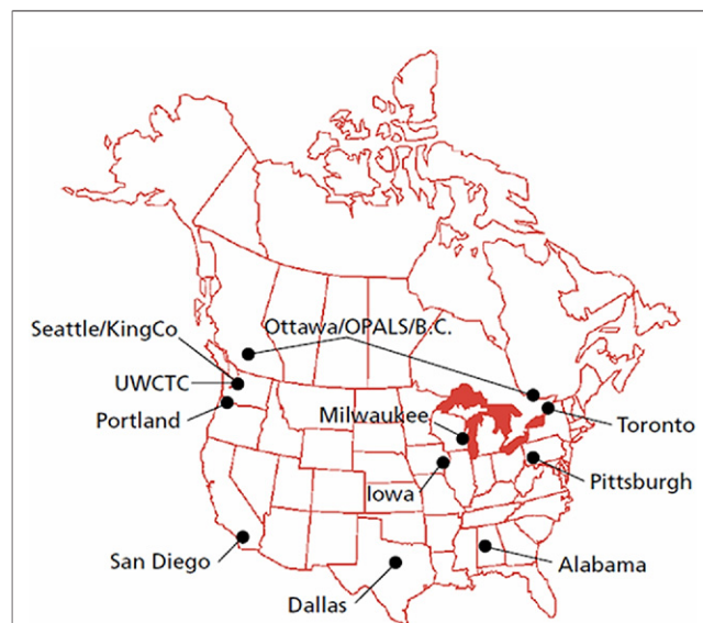
Figure 1 Map of Sites Contributing to the Resuscitation Outcomes Consortium Epistry Database

Manuscript received September 12, 2009; revised manuscript received November 6, 2009, accepted November 23, 2009.