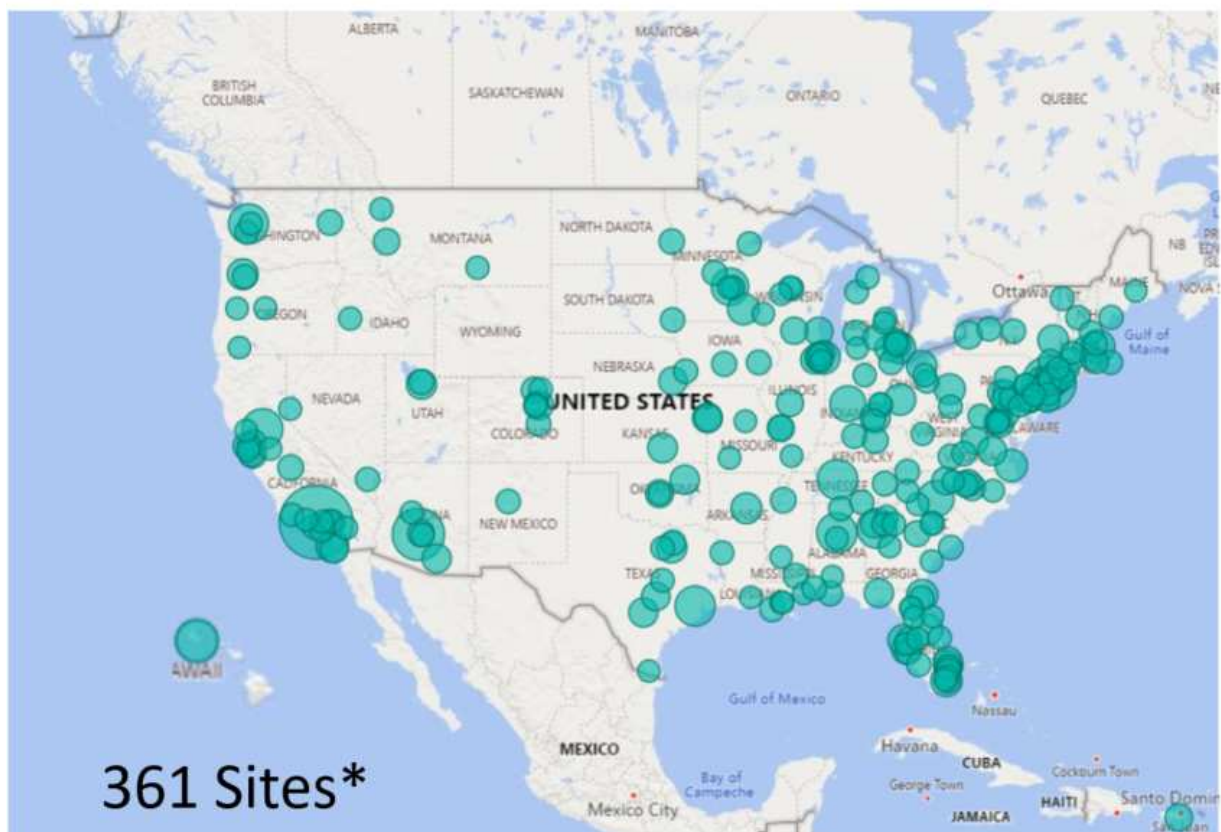
Figure 2. Number of STS/ACC TVT Registry Sites Performing Transcatheter MV Repair with the Edge-to-Edge Clip Device

Defining minimum operator and institutional requirements for these therapies is an important first step to ensuring their optimal implementation. Several of the MDT and proceduralist competencies listed in Table 3 parallel those included in the “2018 AATS/ACC/SCAI/STS Expert Consensus Systems of Care Document: Operator and Institutional Recommendations and Requirements for Transcatheter Aortic Valve Replacement” (2), although many are specific to MV intervention.